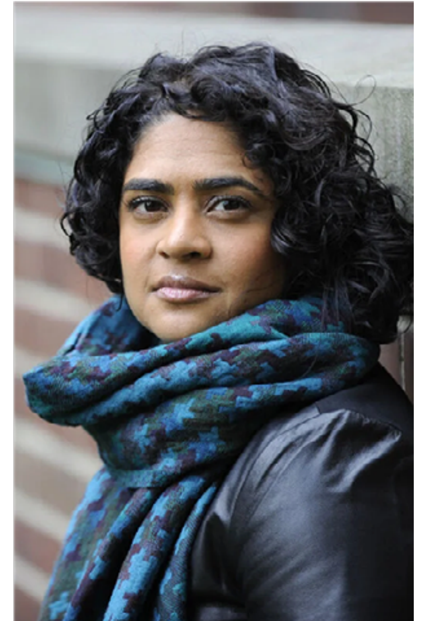
Ena Chadha , Vice-Chair, Ontario Human Rights Tribunal; former Commissioner, Ontario Human Rights Commission