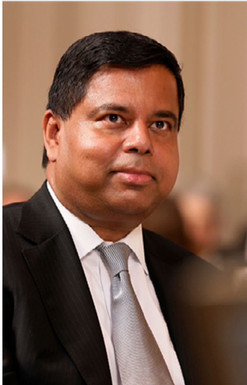
The Honourable Gary Anandasangaree , Minister of Public Safety of Canada; former Minister of Justice, Attorney General, human rights lawyer and Member of Parliament

The documentary features a curated selection of voices shaping the past, present, and future of South Asian representation in Canada's legal system.