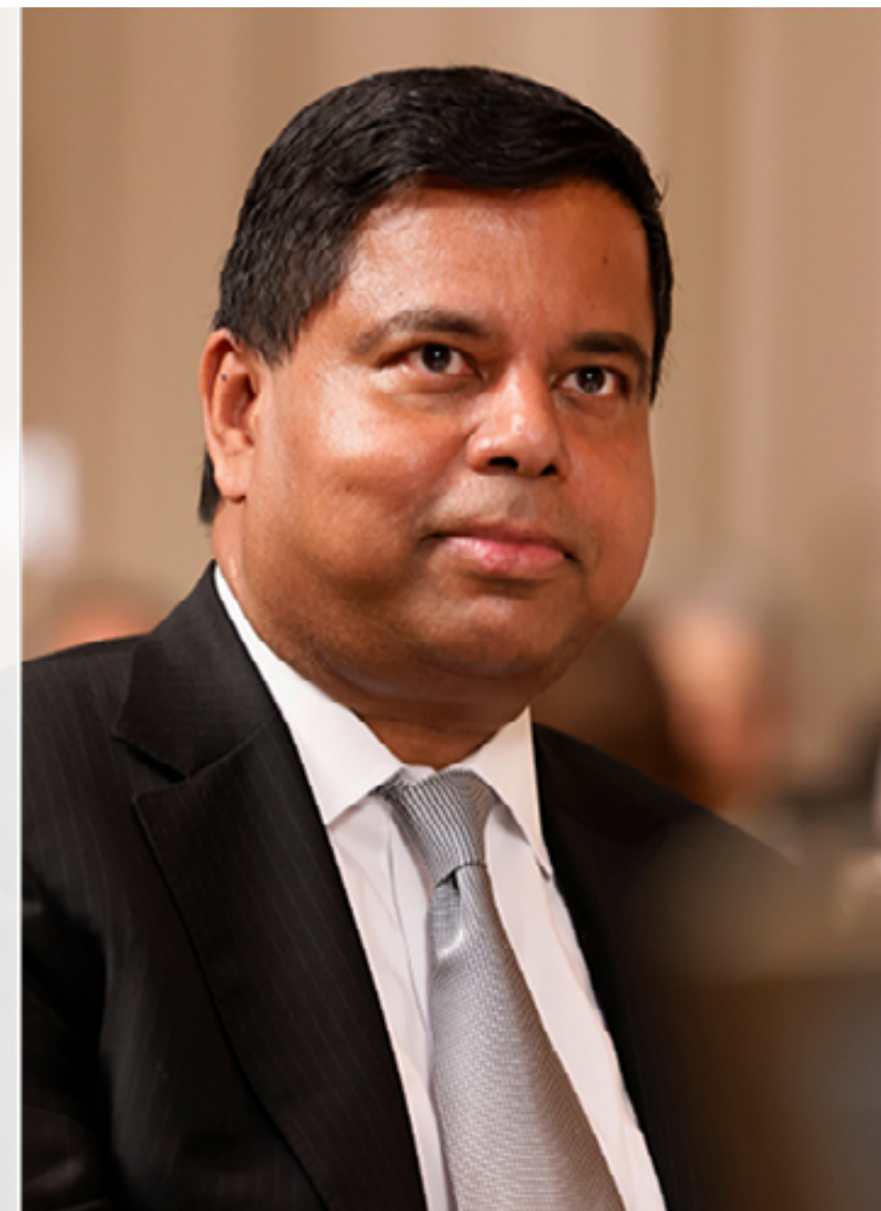
The Honourable Gary Anandasangaree , Minister of Public Safety of Canada; former Minister of Justice, Attorney General, human rights lawyer and Member of Parliament

The documentary features voices shaping the past, present, and future of South Asian representation in Canada's legal system.